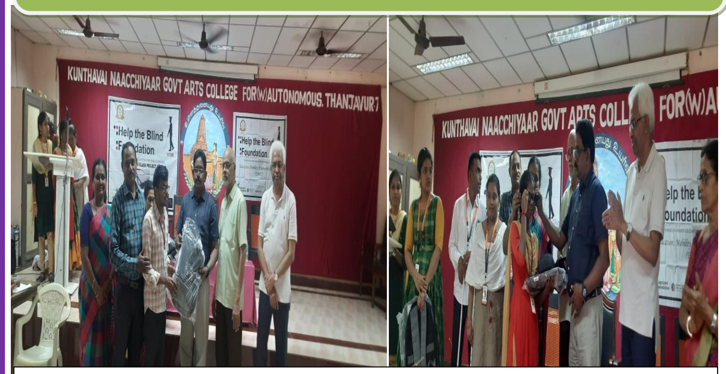
Issued Laptop for training attended students. And also provided Smart Vision Glasses for Visually Impaired students.